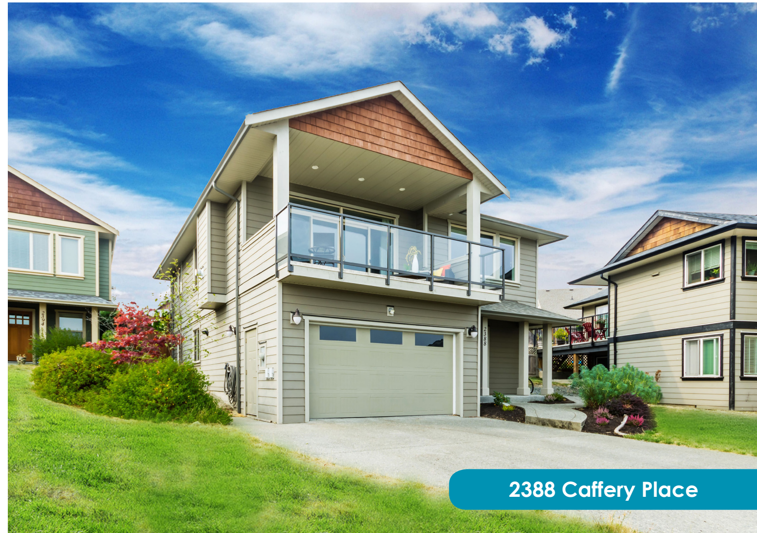
2388 Caffery Place